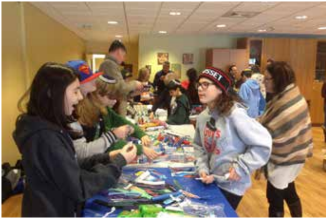
Mitzvah Team packaging supplies for Lone Soldiers