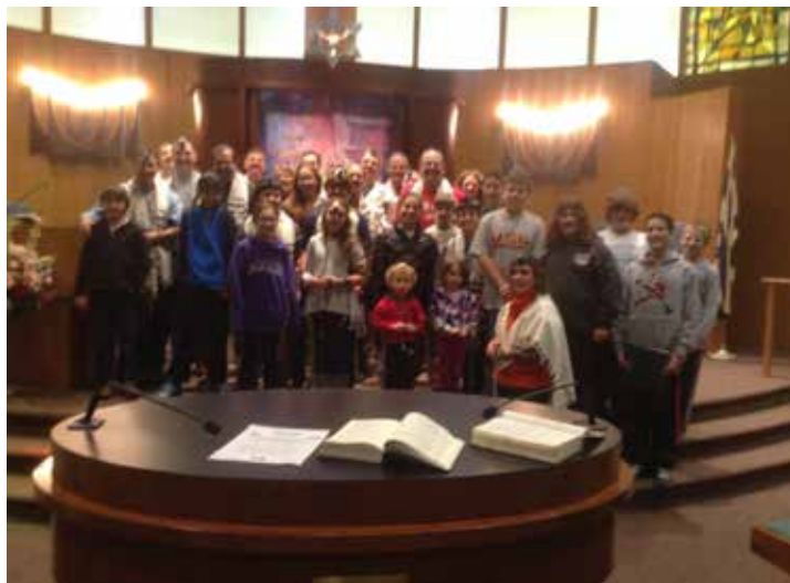
World wide wrap