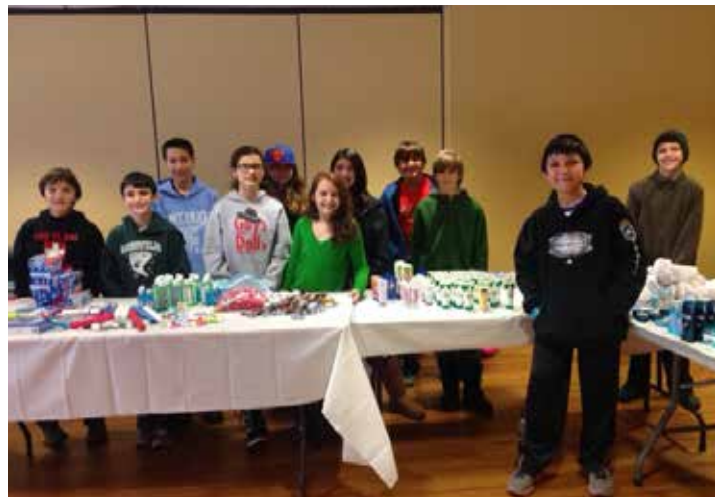
Vav class making packages for Lone Soldiers.