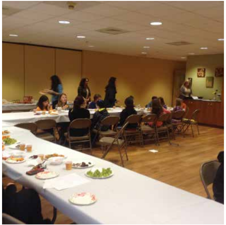
Tu B'Shvat seder