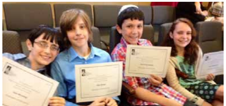
Keter Torah award winners.