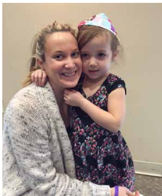
The ECC Passover celebration.