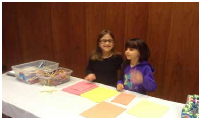
Congregants and students participate in Mitzvah Day.