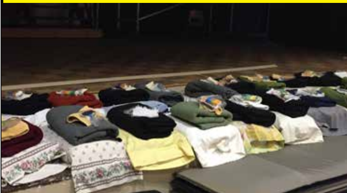
Thanks to the many hands that helped to make the HIHI 2015 Season a wonderful success!