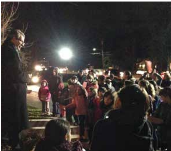
Congregational Menorah lighting