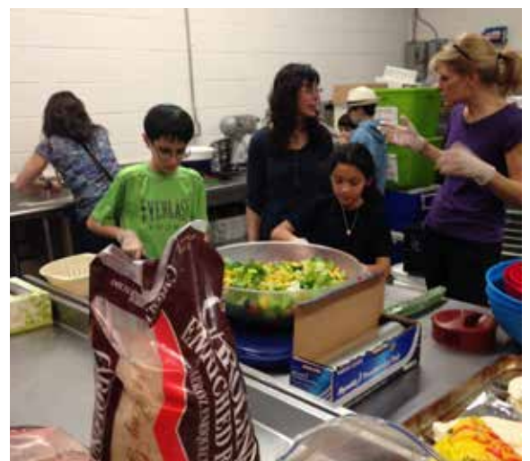
Students prepare for HIHI guests.