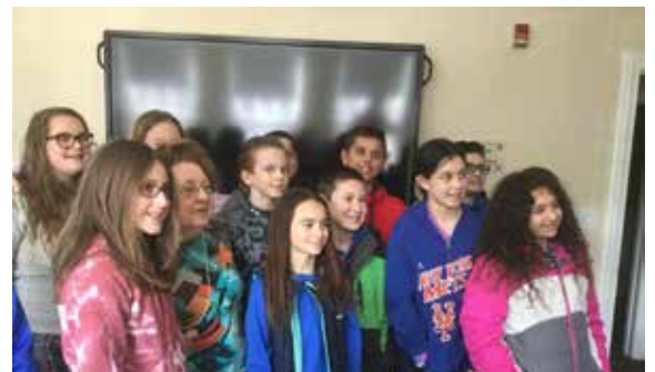
Religious school students visit the Holocaust museum.