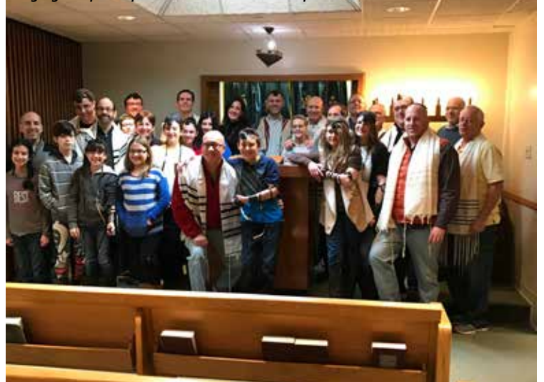
Congregants participate in the World Wide Wrap.