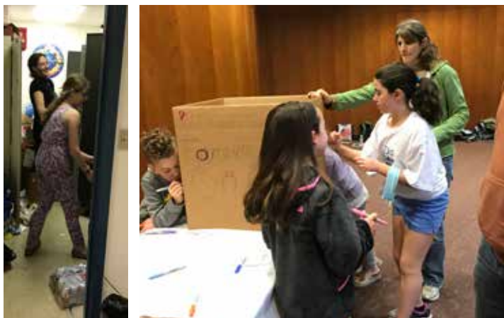
Congregants participate in Mitzvah Day.