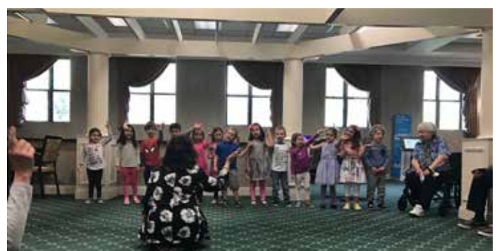
Ecc students entertain residents of Atria.