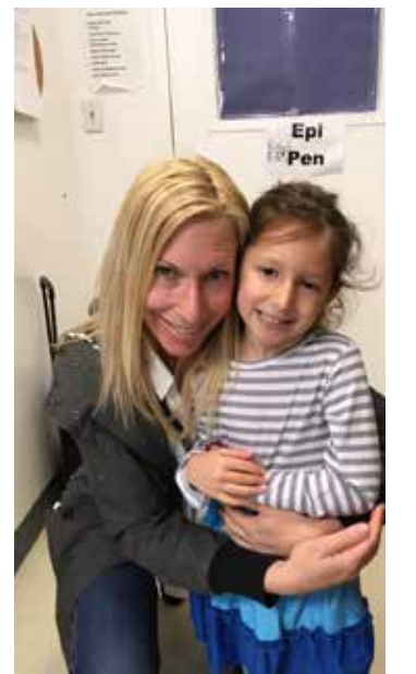
ECC Moms and children on “Mommy and Muffins Day.”