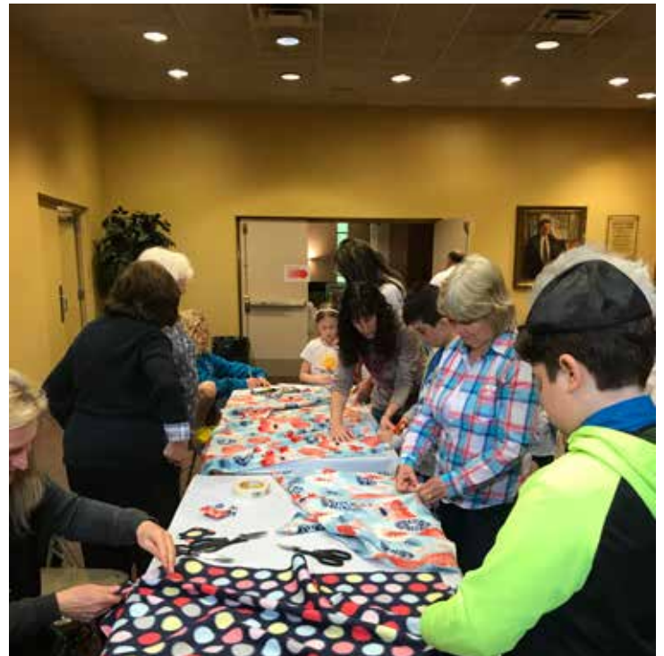
Mitzvah Day festivities.