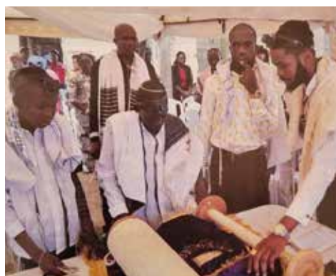
All photos copied from article in Hadassah Magazine