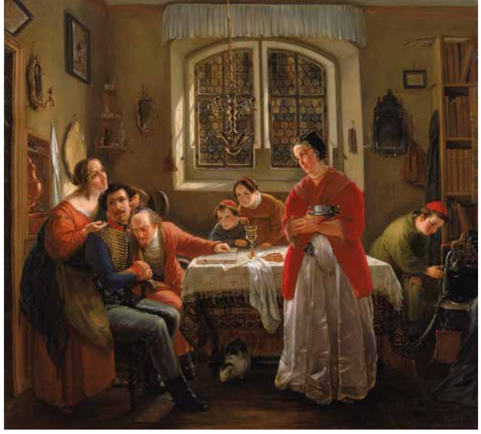
The Return of the Jewish Volunteer from the Wars of Liberation to His Family Still Living According to Old Customs (1833–34)